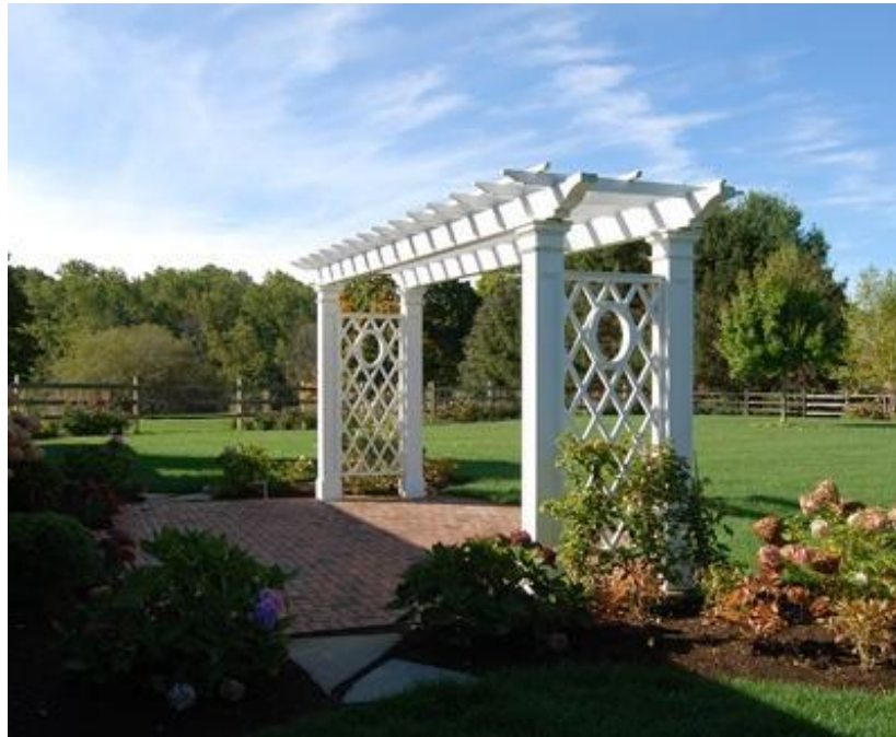
Photo Image of finished custom designed pergola