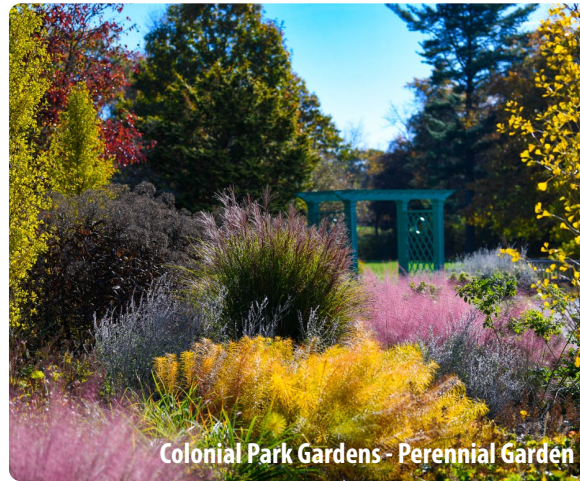
Colonial Park Gardens - Perennial Garden

REGISTRATION: Visit our website at www.somersetcountyparks.org and click Picnic & Program Registration and then Garden Programs. For more information or questions about any of these programs you may call the Leonard J. Buck Garden at 908 722-1200 ext. 5621 or Colonial Park Gardens at 908 722-1200 ext. 5721.